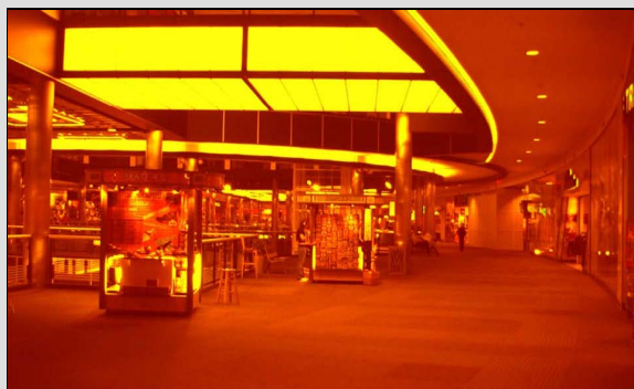
Josephine Meckseper, Mall of America , 2009. Video, transferred to DVD, color, sound; 12:48 min. Collection of the artist; courtesy VG Bild-Kunst, Bonn