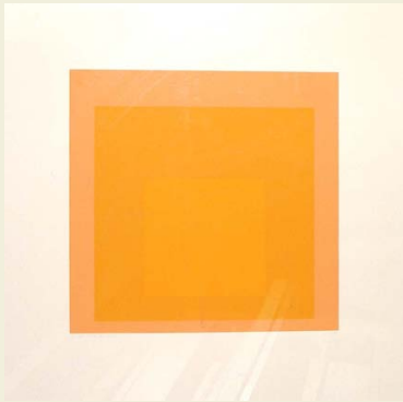
Josef Albers Study for Homage to a Square, 1970

Here are some recognized modern and contemporary international artists whose values are holding up well. You might want to visit the International Fine Print Dealers Fair in New York in November. Also, the annual Baltimore Fair for Contemporary Prints and New Editions ( www.artbma.org ) is always a wonderful fair to attend.