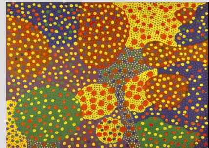
Yayoi Kusama Untitled , 1967 Barbara Mathes Gallery, New York