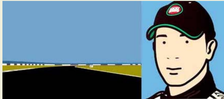
Julian Opi Imagine You are Driving (fast)/Rio, 200 From a series of six lambda prints mounted on PVC Private Collection, NY