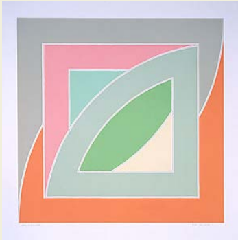
Frank Stella River of Ponds IV (Newfoundland Series), 1971 Eleven color lithograph Private Collection, Miami

Here are some recognized modern and contemporary international artists whose values are holding up well. You might want to visit the International Fine Print Dealers Fair in New York in November. Also, the annual Baltimore Fair for Contemporary Prints and New Editions ( www.artbma.org ) is always a wonderful fair to attend.