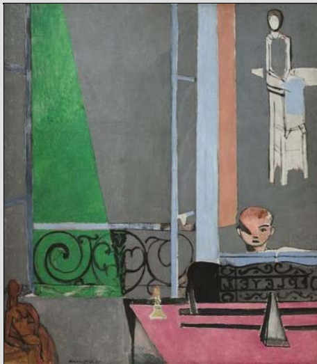
Henri Matisse, The Piano Lesson Issy-les-Moulineaux, late summer 1916 Oil on canvas, 8' 1/2" x 6' 11 3/4" (245.1 x 212.7 cm). Mrs. Simon Guggenheim Fund.

© 2010 Succession H. Matisse, Paris / Artists Rights Society (ARS), New York, 125.1946