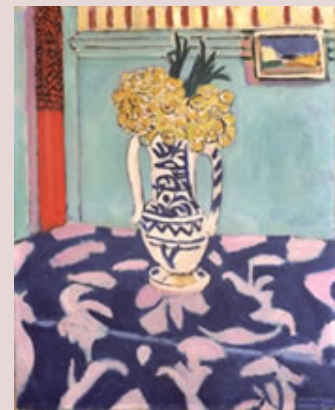
HENRI MATISSE (1869-1954) The Cowslips, Blue and Rose Fabric, 1911 Oil on canvas Yves Saint Laurent and Pierre Berge Collection Christies, Paris