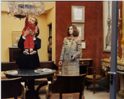
Credit - Tina Barney The Antique Store, 2003 chromogenic color print Edition of 10 Courtesy of Janet Borden Inc., NYC

http://www.aipad.com/photoshow/new-york/