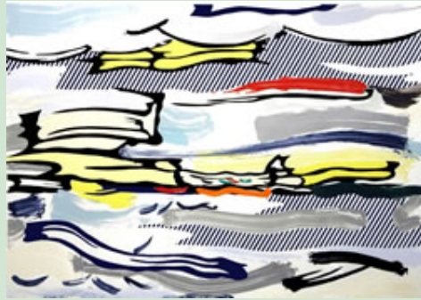
Roy Lichtenstein (1923-1997) Seascape from the Landscape Series, 1985 Lithograph, woodblock and screenprint Edition of 60

Do you know what your collection is worth? You should.