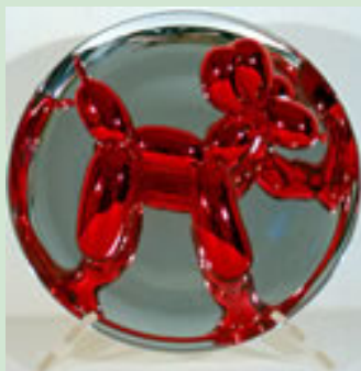
Jeff Koons Balloon Dog, 1995 3-D Cast Porcelain with Reflective Metallic Coating edition of 2300 Originally sold for $400 - $500.00 now approx. $6500-8000 each

Many corporations are not aware of what they own. One international company with an eclectic collection asked us to evaluate the works they had acquired in the 1960s. They weren't sure of the worth of their purchases, or even which ones should be displayed and which should be sold.