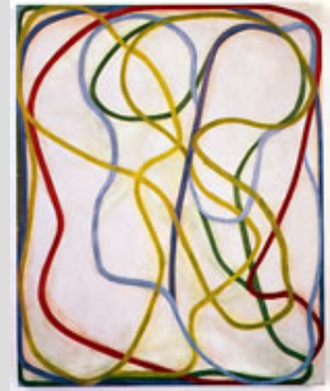
Brice Marden (American, b. 1938) Skull with Thought , 1993 – 95. Oil on linen, 70 7/8 x 57 inches. Private collection. © 2008 Brice Marden/ Artists Rights Society (ARS), New York