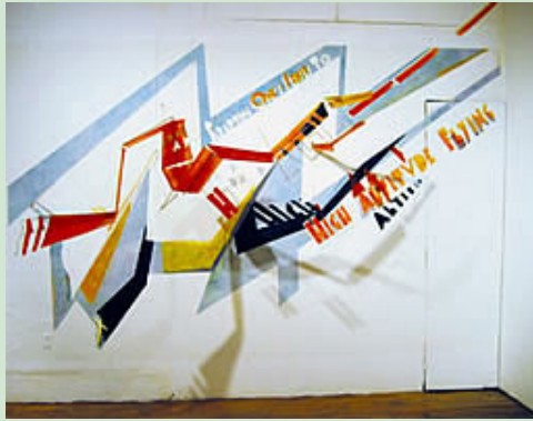
Vector Orange (Adapting One's Senses to High Altitude Flying) 2003-2006 Various materials